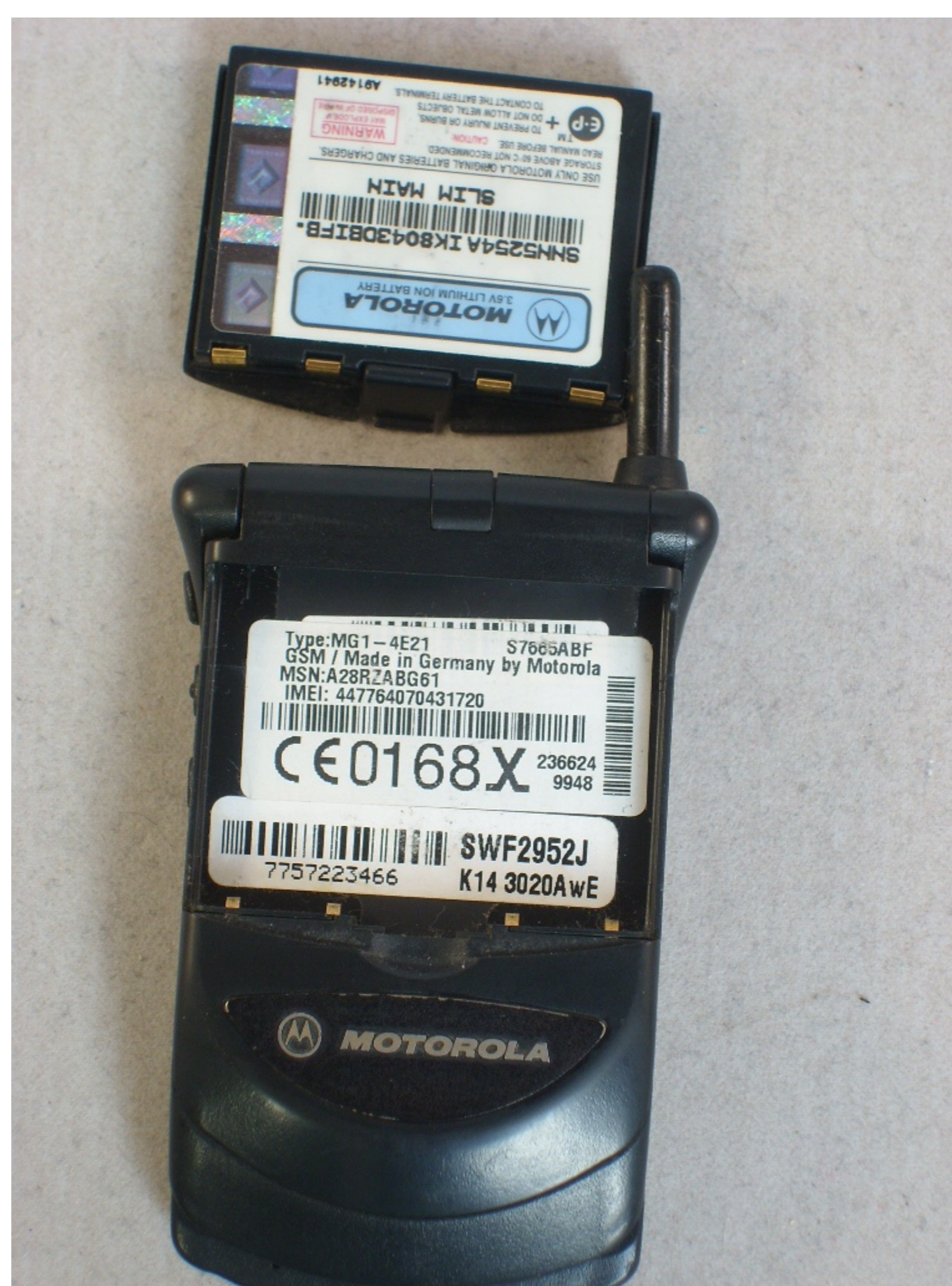
Startac 130 Manual